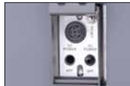
built in power and reset switches