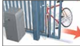
entrapment prevention system reverses gate on contact