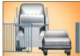
partial open allows long gates to open 14 feet for automobile traffic, or opens gate fully for large trucks or oversized vans