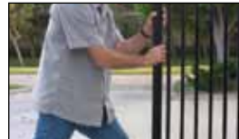
fail-safe release Never be locked out (or in) of your property